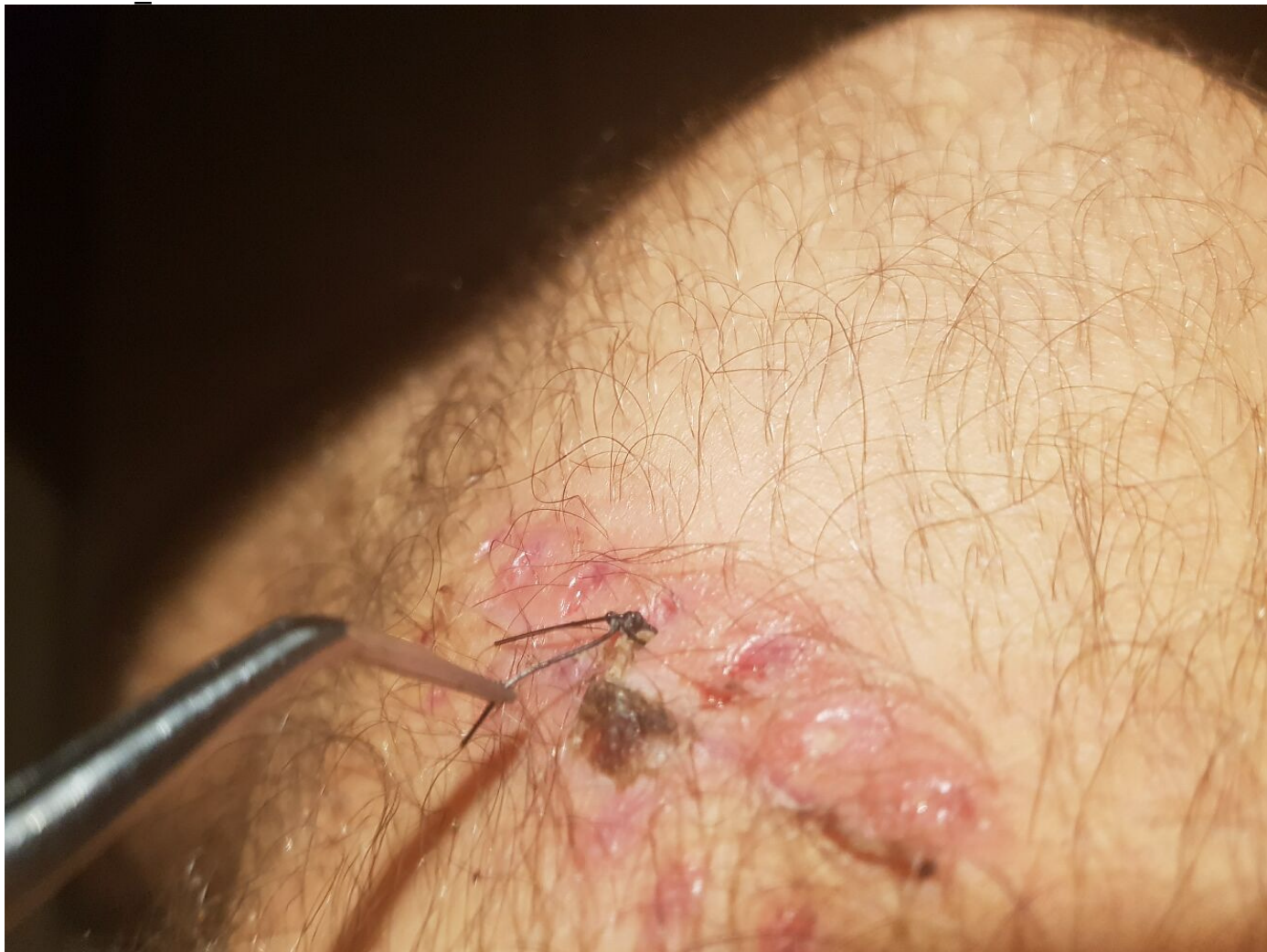
Self-removal of the last plastic thread on 16.06.24, which has ingrown into the wound.