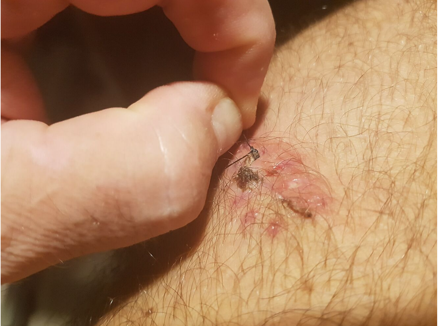
Self-removal of the last plastic thread on 16.06.24, which has ingrown into the wound.