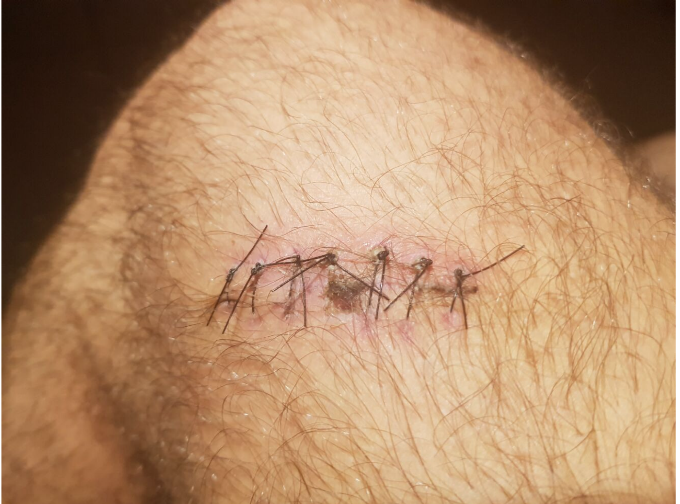
The postoperative wound before plastic threads self-removal on 16.06.24.