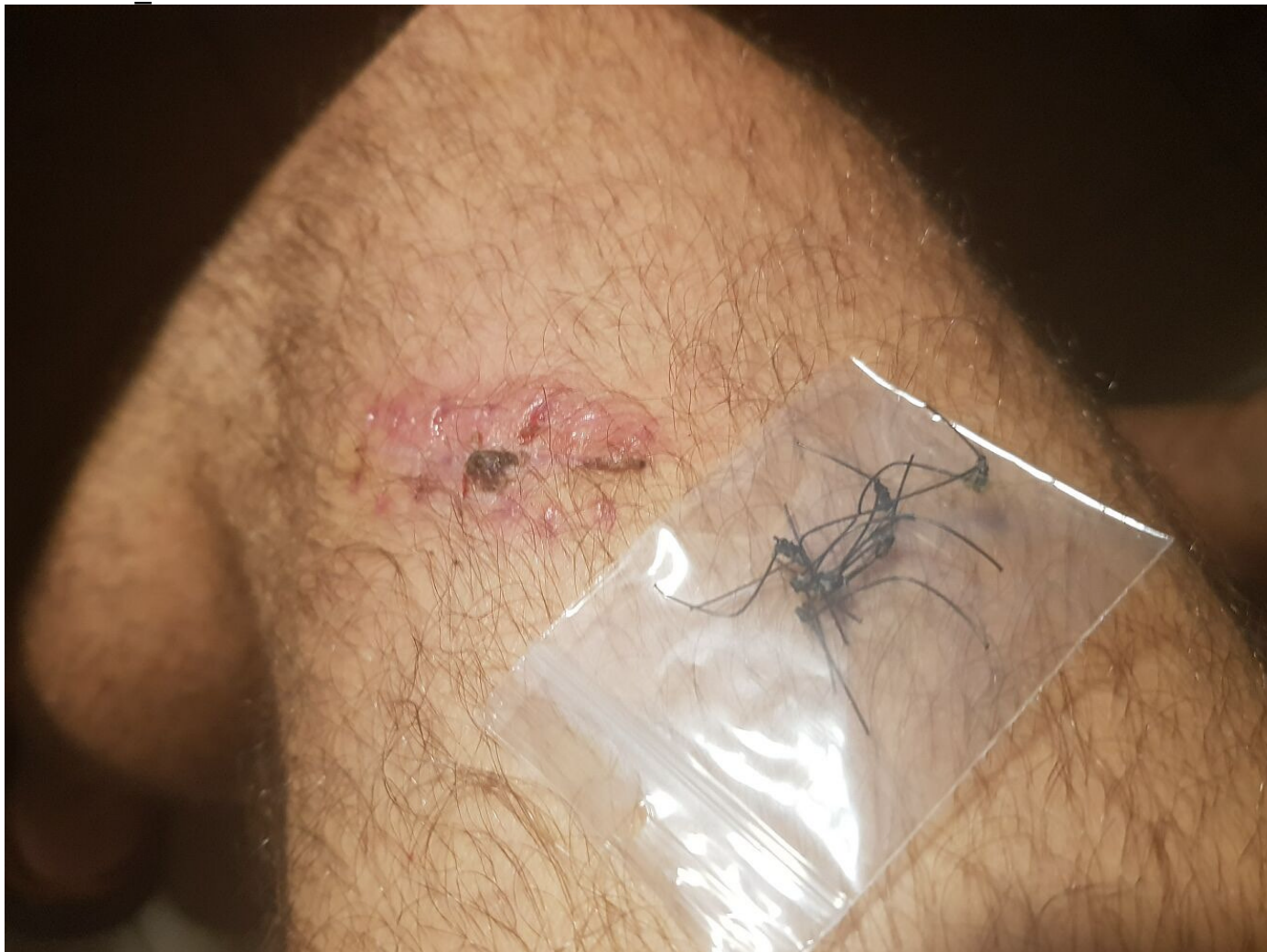
The self-removed plastic threads on 16.06.24