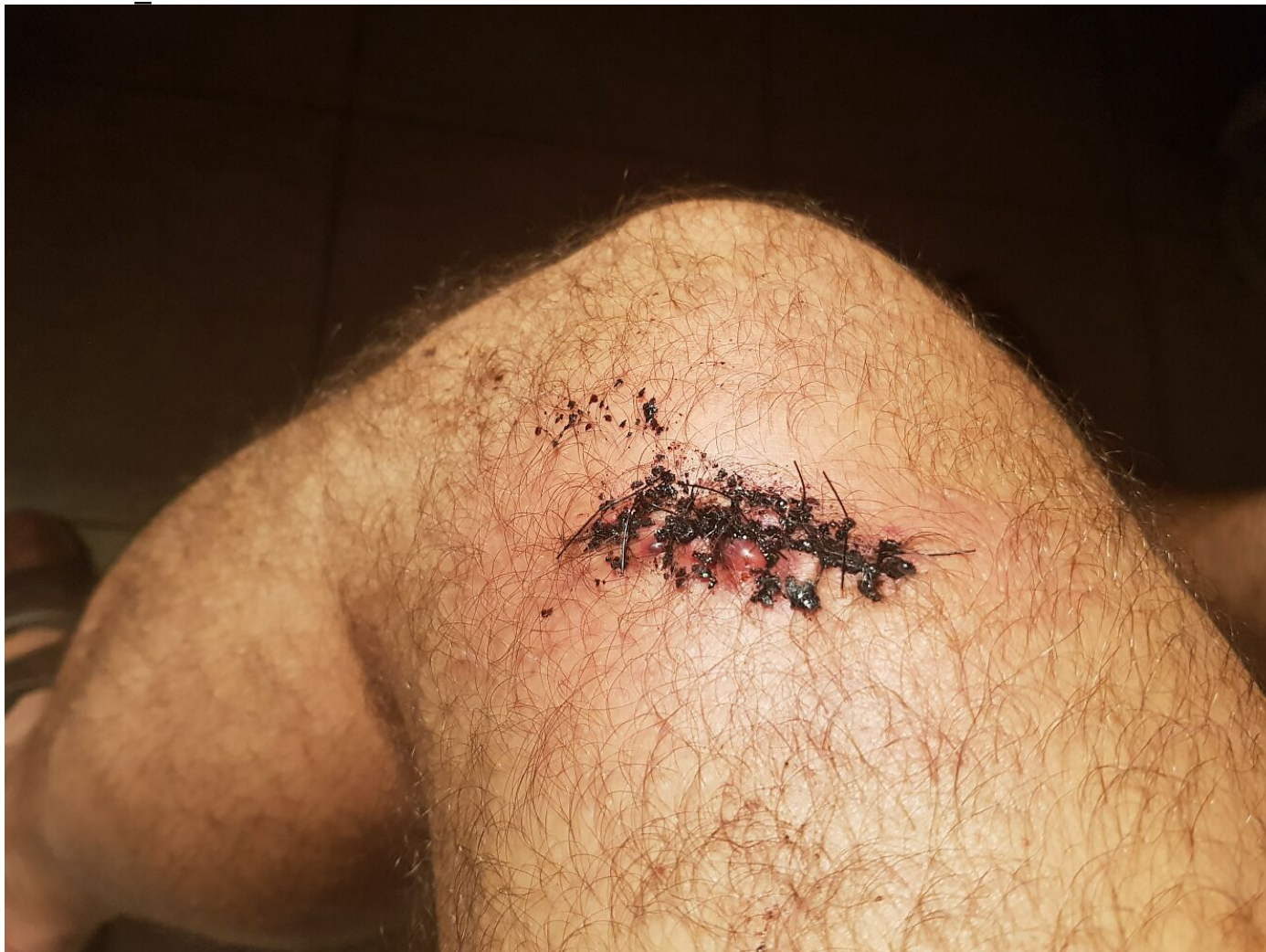
The postoperative wound with the plastic threads on 27.05.24 (assumed on the day of operation).